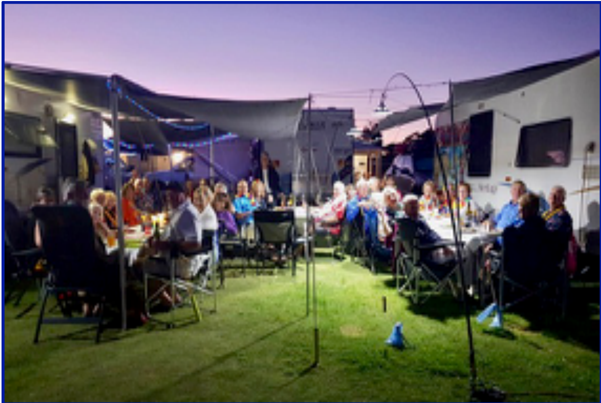
Sandgroper's enjoying a Luau at Ledge Point.

Sandgroper's enjoyed another fantastic rally at Ledge Point. Read all about it in this Gossip plus: