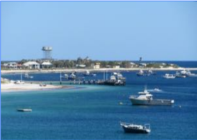
Beautiful views over the water at Lancelin

Thirty-four remaining Sandgropers travelled fifteen minutes to Lancelin for a lovely lunch at the Dunes Restaurant in the Lancelin Hotel. The pub boasts the most scenic beer garden in the state and we could hardly disagree with them. After another delicious meal (like we needed it!) we adjourned to the beer garden for coffee and took in the stunning views of the turquoise ocean and the bobbing cray boats. A picture perfect end to a wonderful weekend.